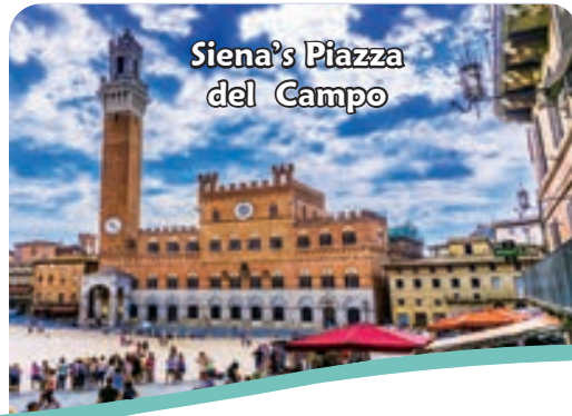
Siena's Piazza del Campo